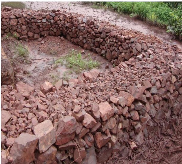
Pic-7: Check weir along the nallah