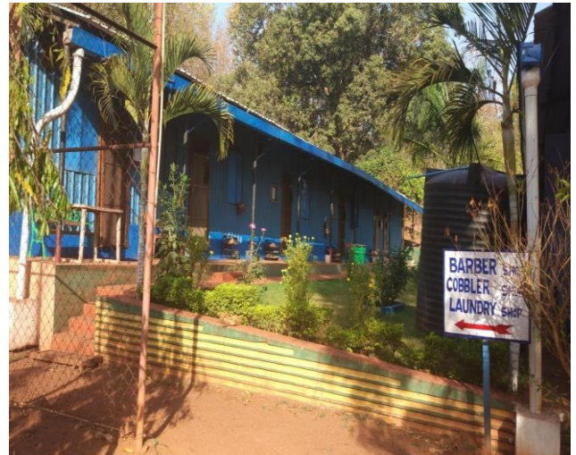
Pic-4: Roof top rain water harvesting structure