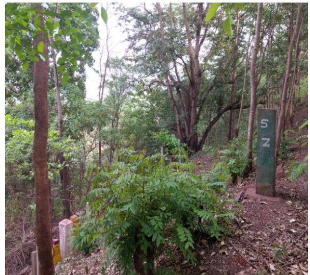
Pic-8: Plantation of S/z