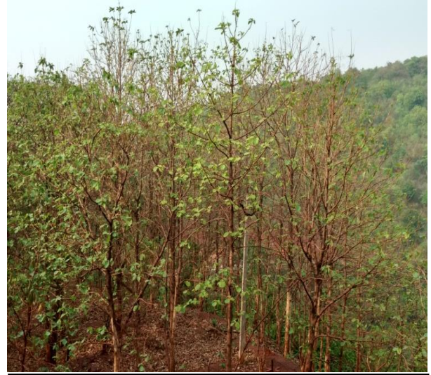
Pic-2- Dump Stabilization with with plantation