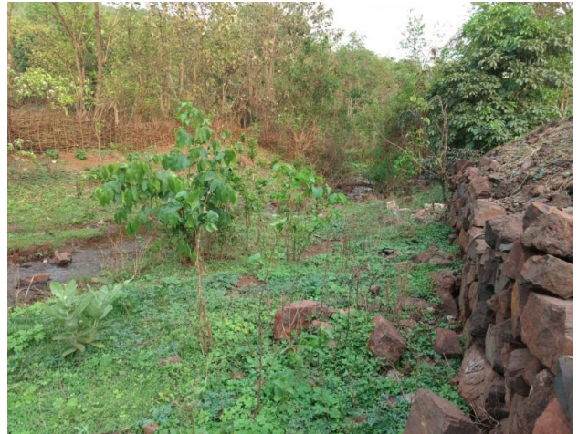
Pic-6: Guard wall along the Nallah