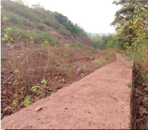
Pic-1- Retaining wall constructed at the base of sub-grade dump