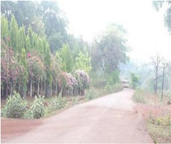
Pic-5: Black Topped road for mineral dispatch