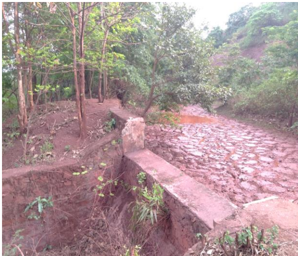
Pic-3: Settling Pond & Check Dam